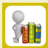
iCreate: Social Skills Stories