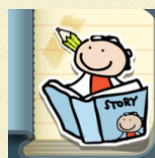
Kid in Story Book Maker